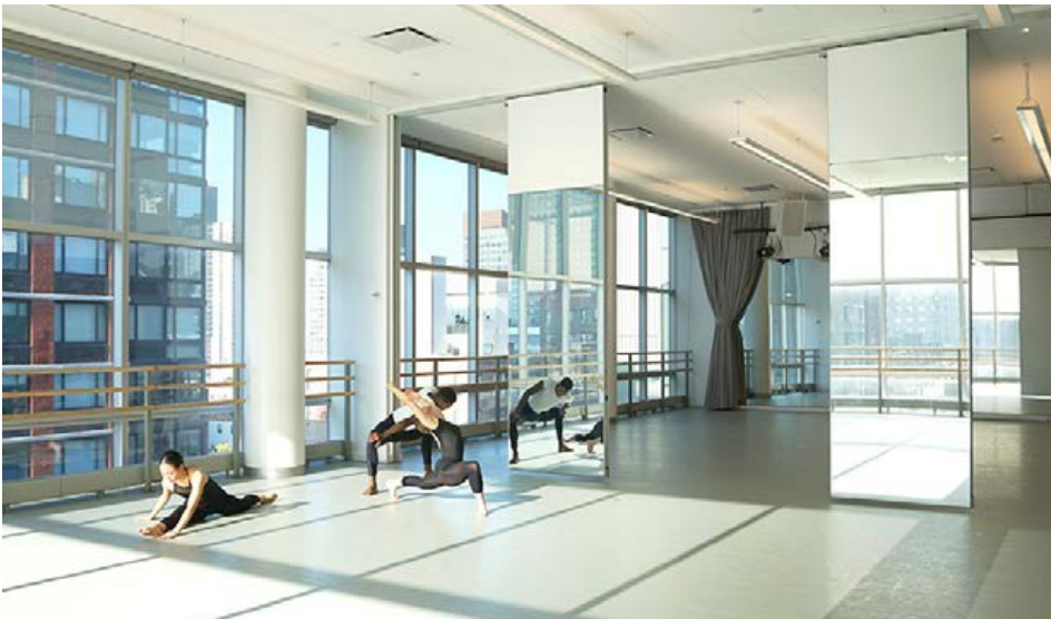
Students from The Ailey School's Professional Division. Encore 14 ft. mirrored panels.

“Sound rating is a key factor in the design” explained Senior Project Architect Harold Gross. So the walls had to have the highest possible sound rating. The great studio on the sixth floor, which can also be used as an event space or photography studio, is designed so the 2,700 sq. ft. space can be converted into two dance studios by means of a mirrored operable wall. However, the design did present some challenges. The walls needed to fit the huge scale of the room and be stored in a way that uses minimal space. “ModernfoldStyles was the only company that could supply the required wall layout with the highest acoustical rating.” Mr. Gross concluded.