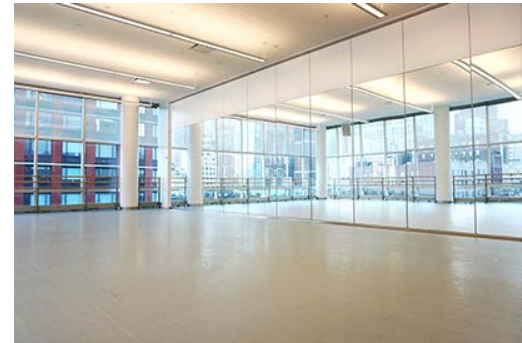
Modernfold Encore 14 ft. mirrored panels – closed

With mirrors applied, each of the twelve steel Encore panels weigh about 900 lbs. Although heavy and structurally robust, the panels glide effortlessly on the structural steel-supported ceiling track with no floor tracks required.