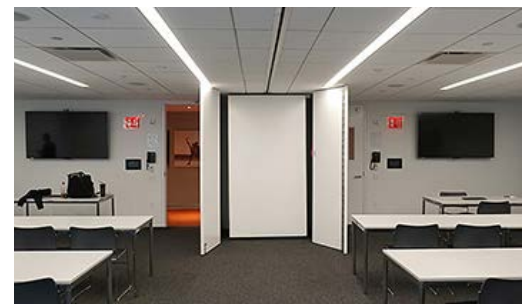
Modernfold Encore Paired Panels

In addition to the panels in the main dance studio, a second, smaller Modernfold Encore Paired Panel system (56 STC) was installed on the fourth floor. This system easily divides one large classroom into two smaller rooms as needed. The panels establish Ailey's creative space, whether open for an educational presentation or closed for concentrated study.