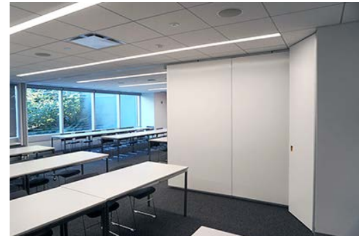
Encore Paired Panels - Classroom Dividers