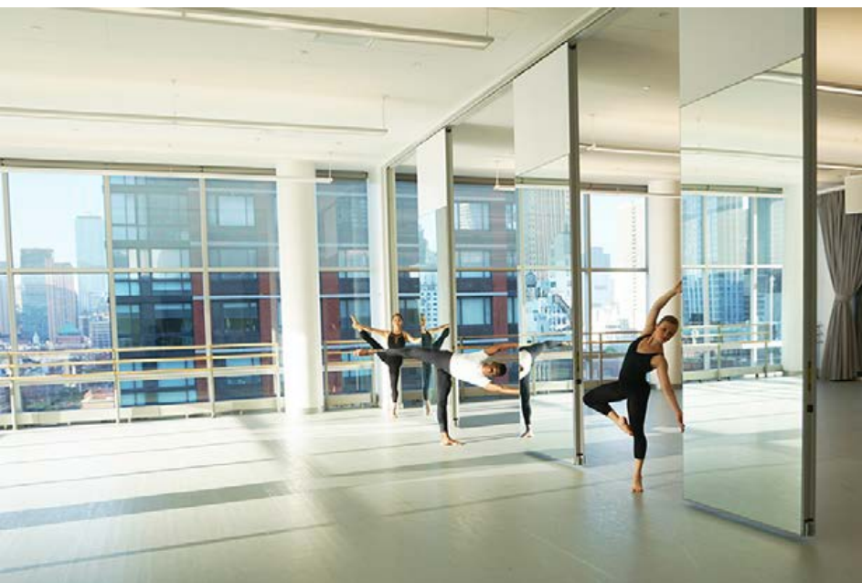
Students from The Ailey School's Professional Division.

In addition to the panels in the main dance studio, a second, smaller Modernfold Encore Paired Panel system (56 STC) was installed on the fourth floor. This system easily divides one large classroom into two smaller rooms as needed. The panels establish Ailey's creative space, whether open for an educational presentation or closed for concentrated study.