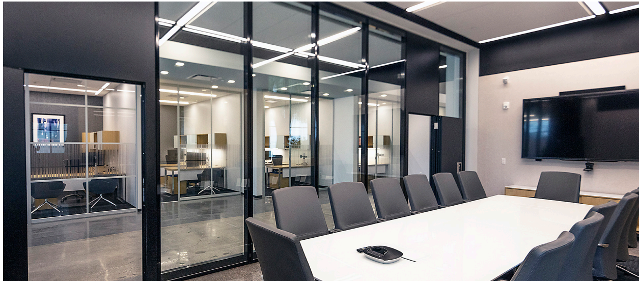
Modernfold Automated, Self-Driving ComfortDrive (Prototype)