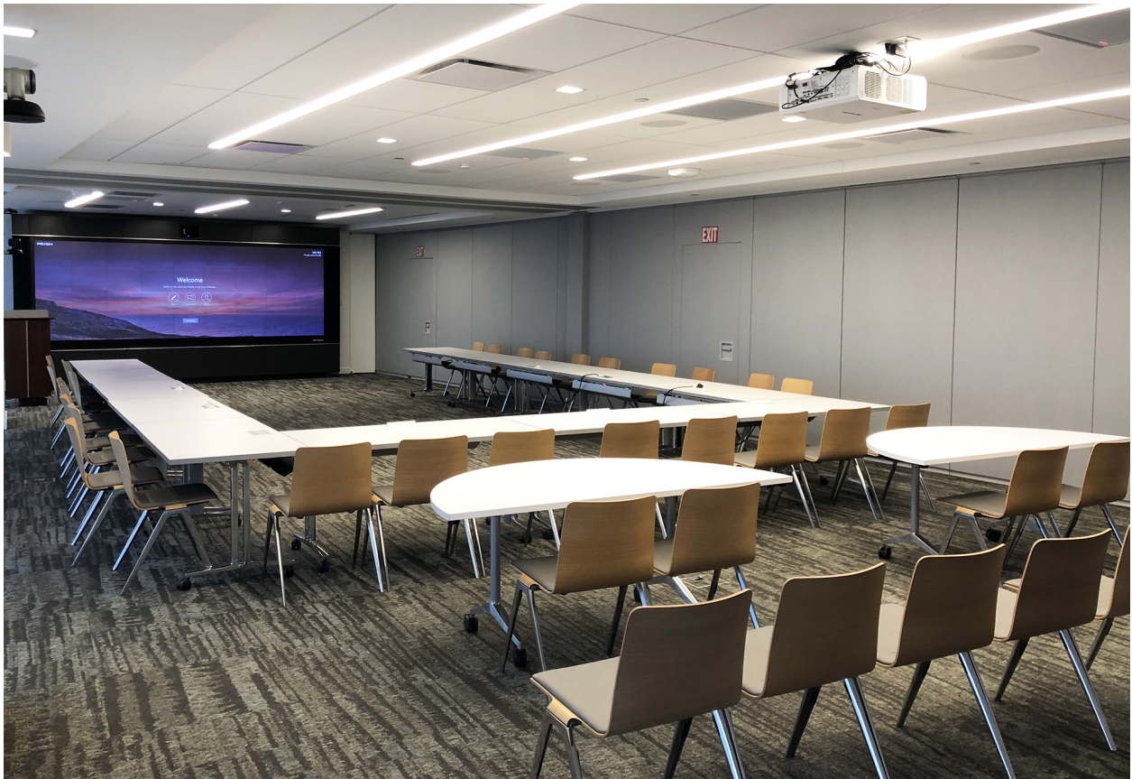
SAP Hudson Yard: Modernfold Encore + Skyfold Classic 60