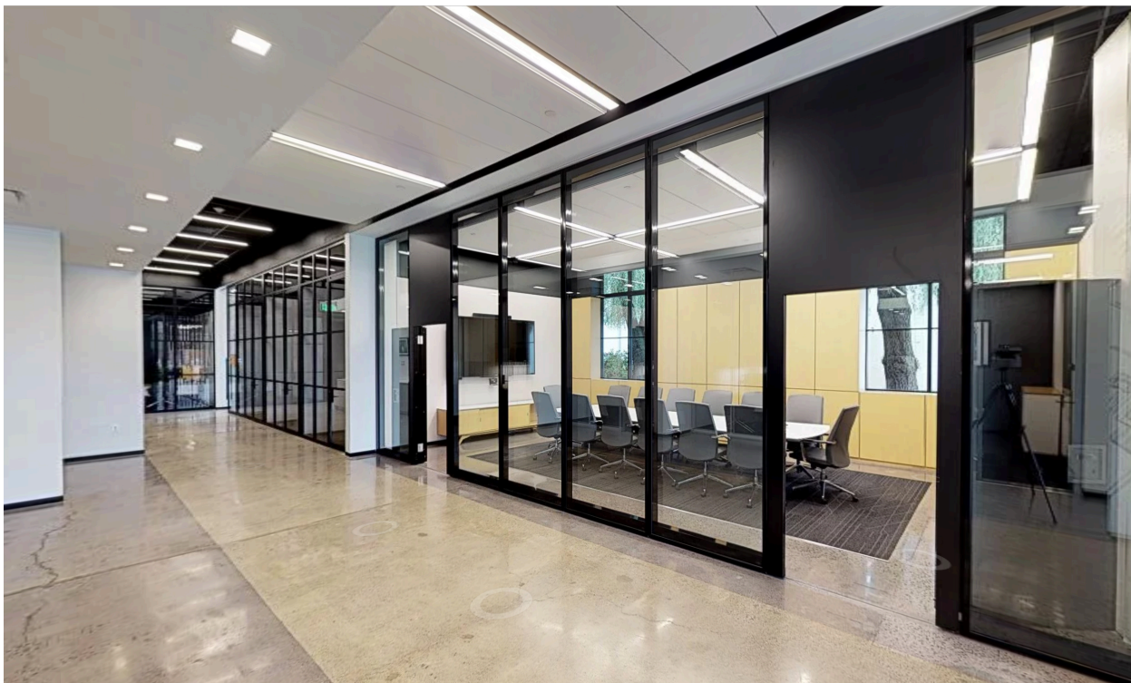
Modernfold Automated, Self-Driving ComfortDrive (Prototype)

As a result, we have helped create and improve upon existing products that set the standards high within the architectural wall industry. We are often the first supplier asked by our manufacturers to help perfect new prototypes. An example is the innovative 30’x12’ electrically-operated Modernfold ComfortDrive glass and solid partition installed in our Showroom. It is the first and only one of its kind on display in North America for customers to see and operate and will be available early 2020.