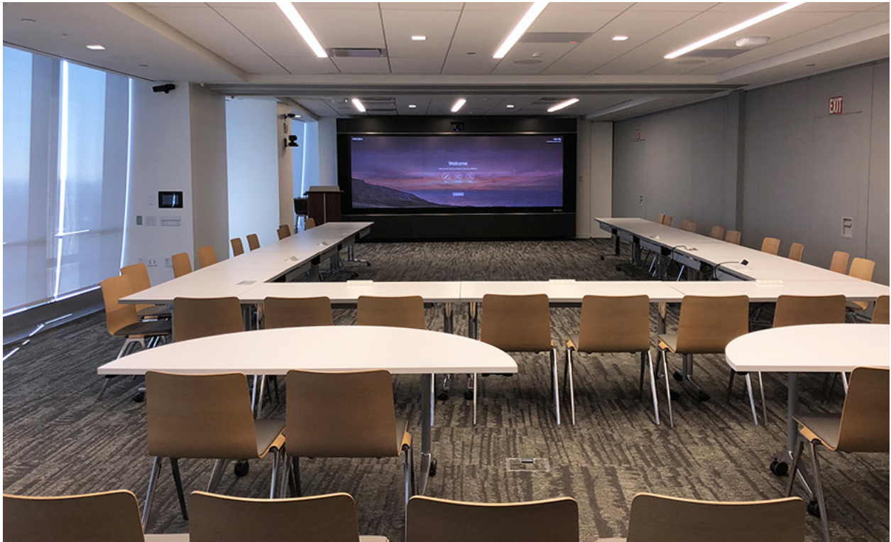
SAP Hudson Yard: Modernfold Encore + Skyfold Classic 60