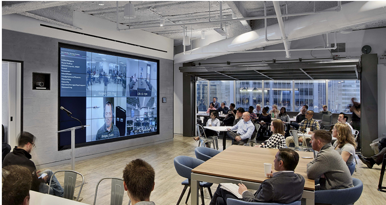
Blackstone NYC: Renlita S-1000 Floataway Door